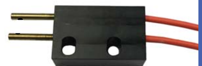
RAA-LT880 Transmissive Head